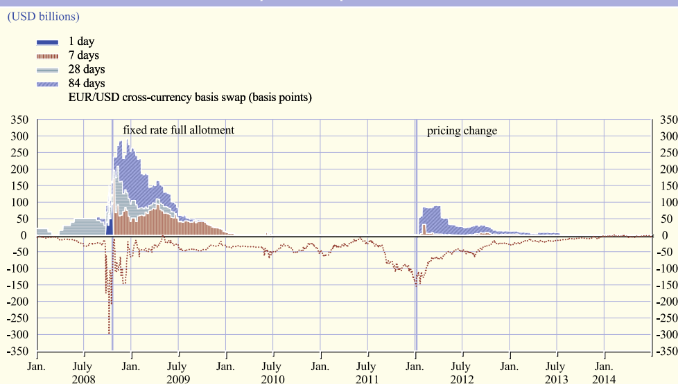
Chart 1 Outstanding amounts in the Eurosystem's US dollar-providing operations versus three-month EUR/USD cross-currency basis swap

For these reasons, on 12 December 2007 the Bank of Canada, the Bank of England, the ECB, the Federal Reserve and the Swiss National Bank announced coordinated measures designed to address elevated pressures in short-term funding markets. As part of these measures, the ECB established a temporary swap line with the Federal Reserve and initially conducted two US dollar liquidity-providing operations, in connection with the US dollar Term Auction Facility (TAF), against ECB-eligible collateral. In the first half of 2008 further operations were conducted in which the ECB offered a fixed amount of US dollars at the marginal rate resulting from the TAF conducted in a coordinated manner in the United States over a maturity of initially one month, which was later complemented by operations with a tenor of about three months. In this first phase, the US dollar provision helped European banks to address their structural US dollar funding needs resulting from their US dollar-denominated assets and from the US dollar funding needs of their euro area customers. According to BIS estimates 4 , this funding gap had reached at least USD 1.0 trillion by mid-2007 and, until the onset of the crisis, had been met by tapping the interbank market, by borrowing from central banks and by conducting foreign exchange swaps to convert primarily